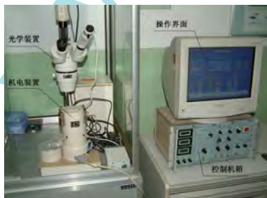
Fig.1. CSPM-930b SPM